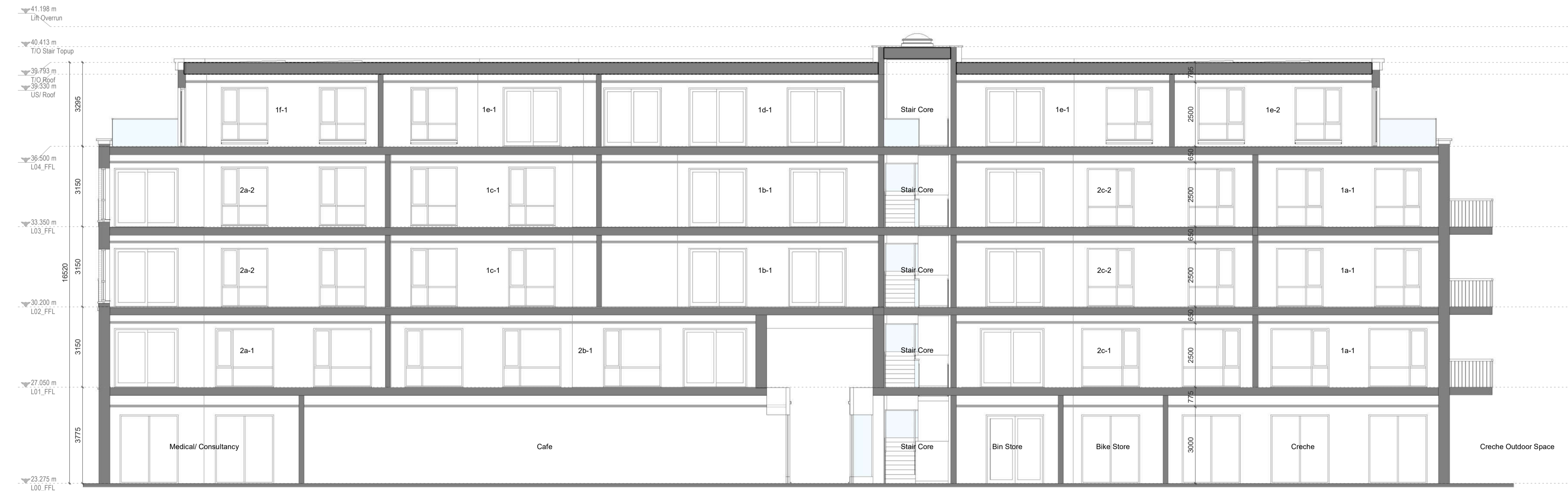
3 Section 3 1 : 100