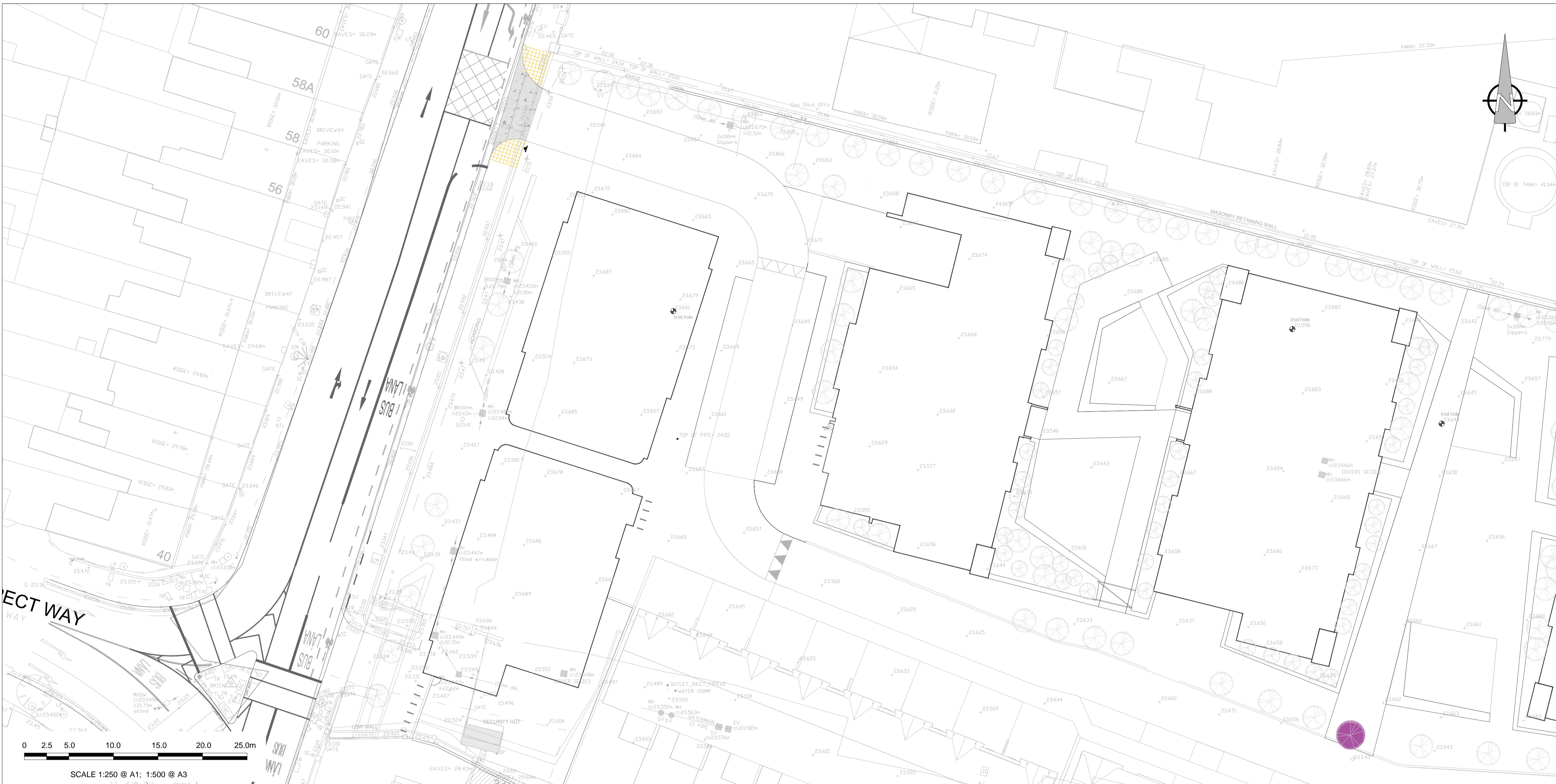
A EXISTING SITE ACCESS LAYOUT