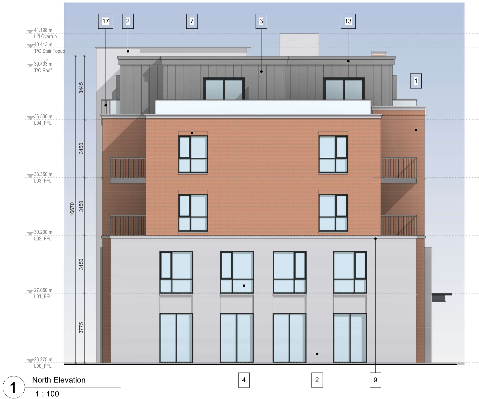
1 North Elevation 1 : 100