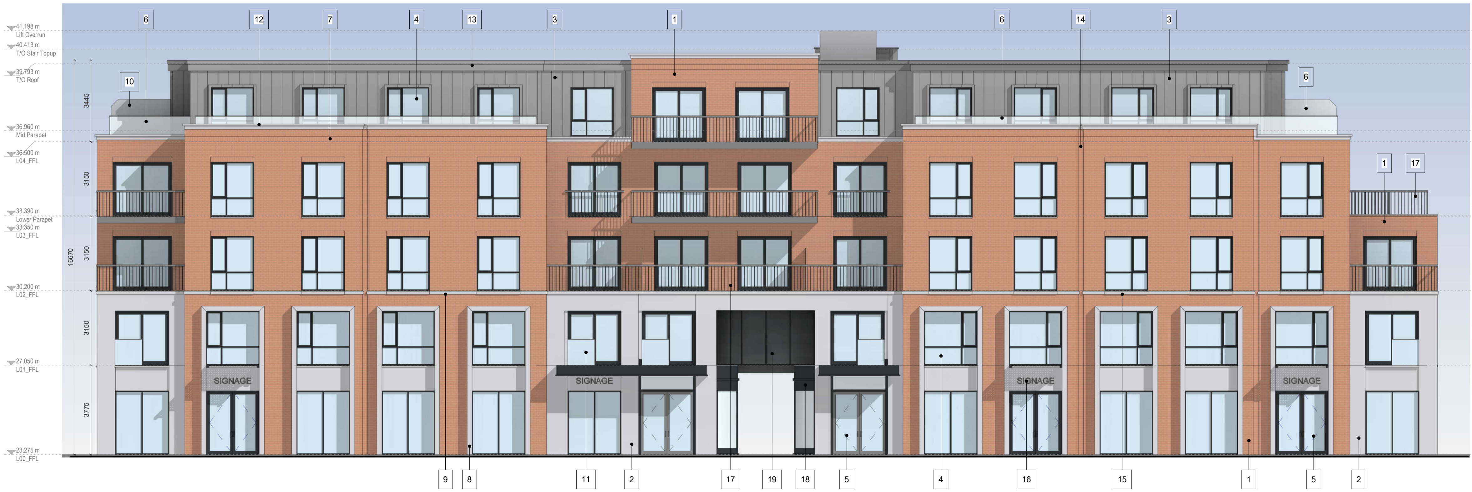
2 West Elevation 1 : 100