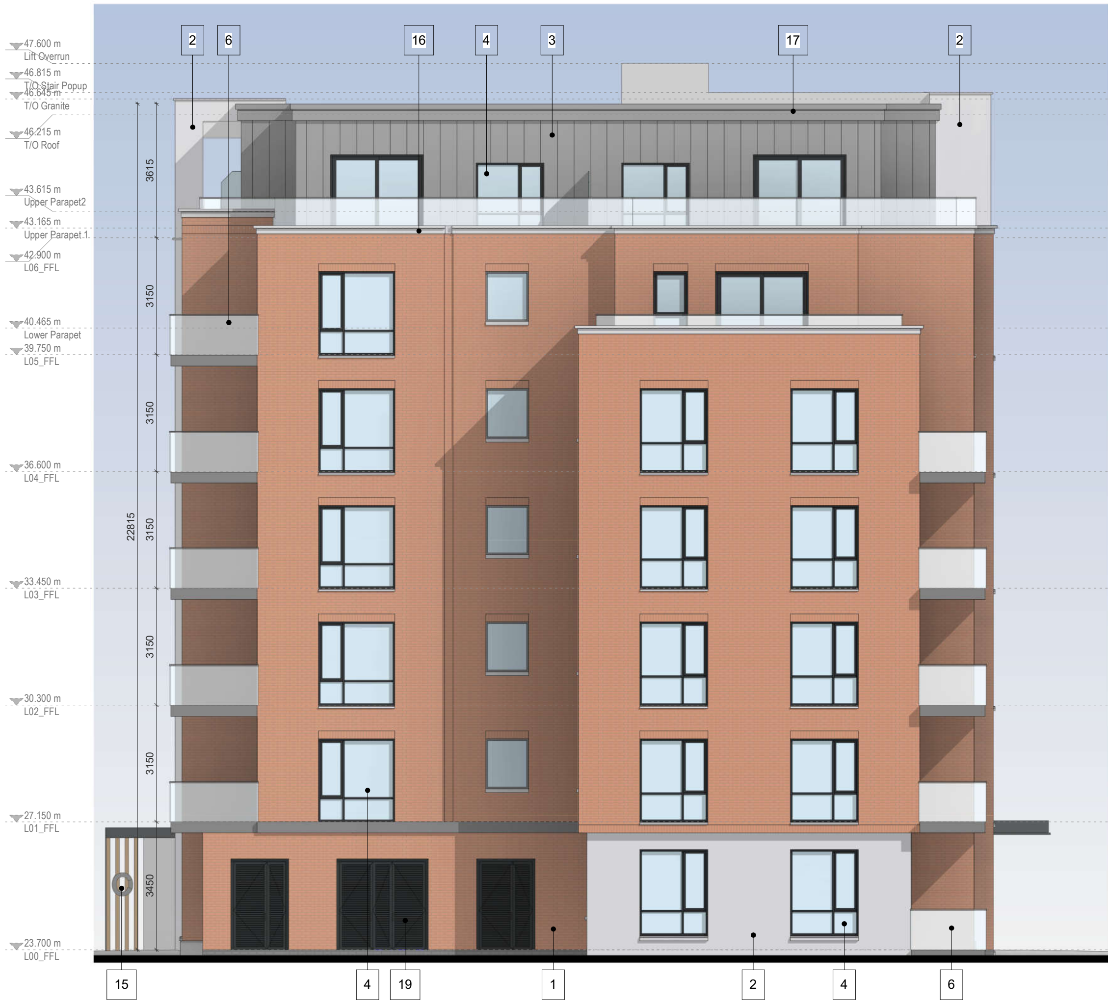
1 South Elevation 1 : 100