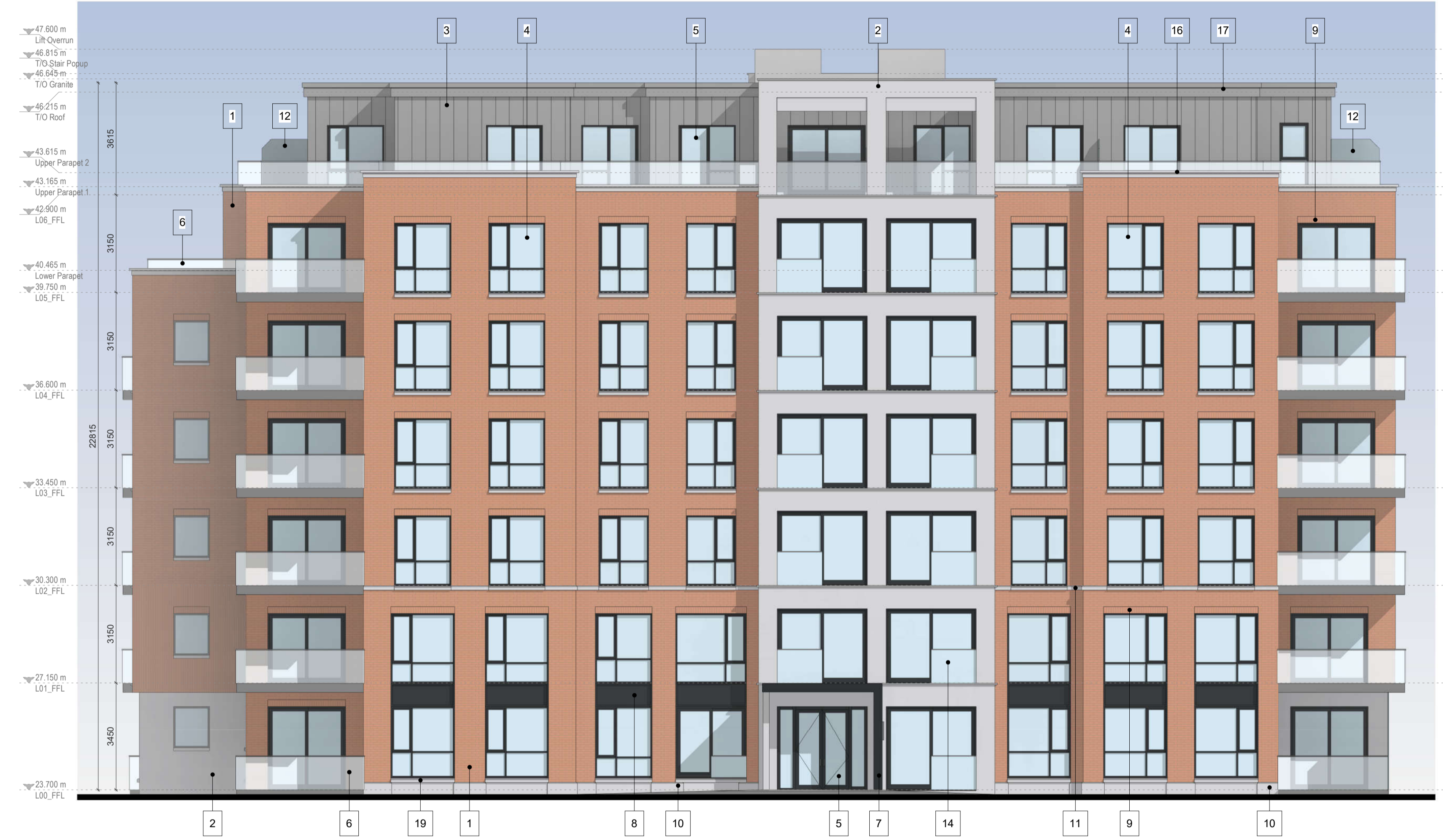
1 North Elevation 1 : 100