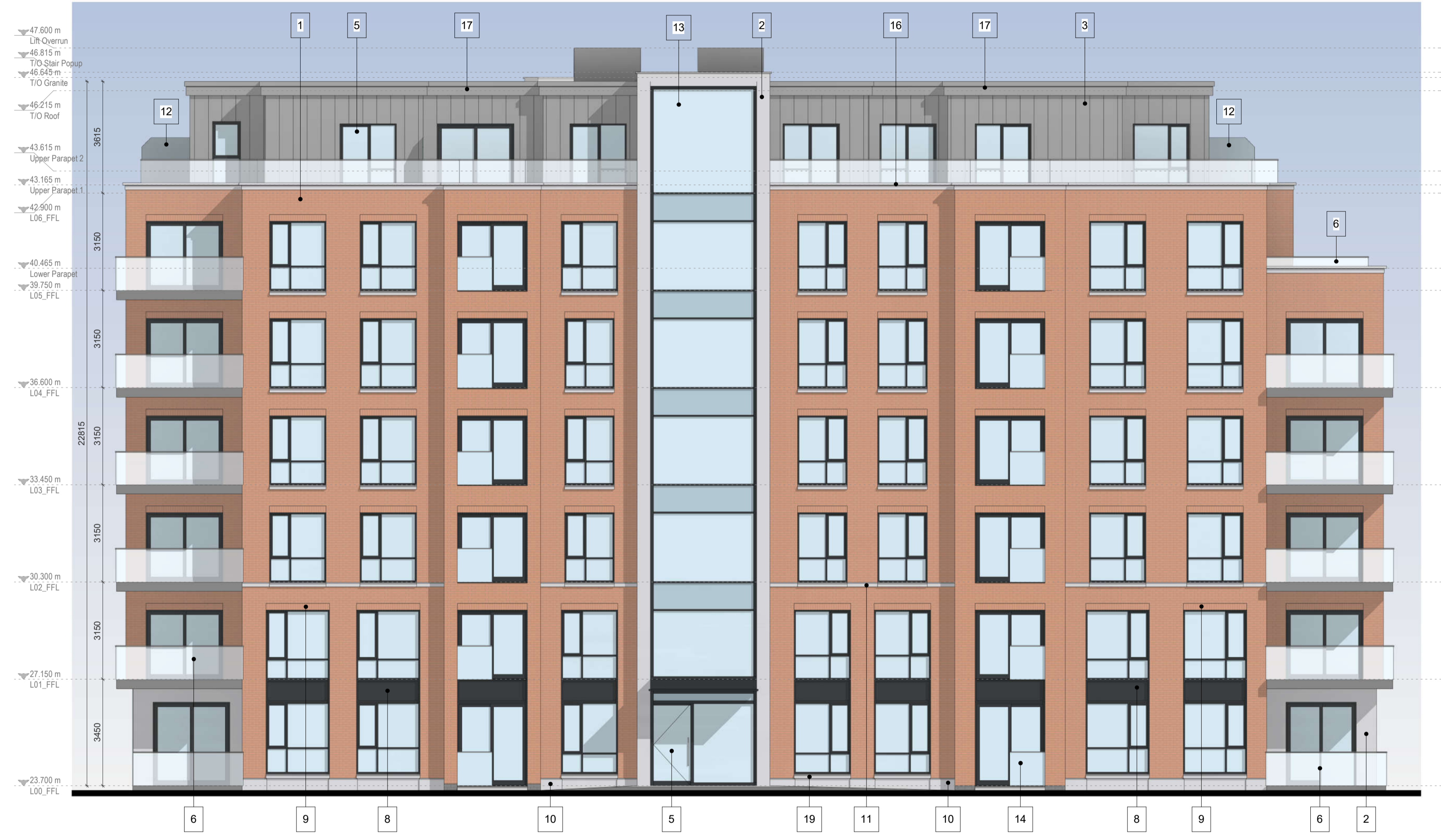
2 West Elevation 1 : 100