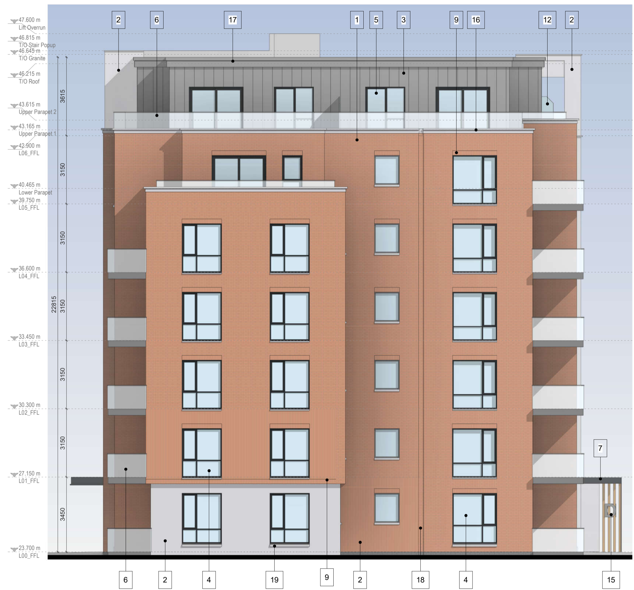
1 South Elevation 1 : 100